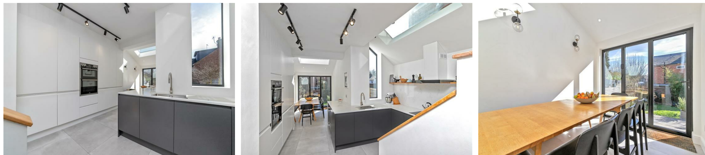
Ground Floor Approx. 524.6 sq. feet

** Chain Free** A tastefully extended three bedroom period property situated in the popular conservation area, just a short walk to the City centre and convenient for the mainline station. This exquisite home provides generous and stylish ground floor accommodation to include an entrance hallway, living room with feature fireplace and a family room leading onto a stunning open-plan kitchen/diner with bi-folding doors onto a picturesque rear garden. This superb area is ideal for entertaining with an array of feature windows attracting natural light and a vaulted ceiling. In addition, there is a downstairs cloakroom. On the first floor, there are two double bedrooms with luxury four-piece bathroom and an additional bedroom on the second floor. The property is finished to a high standard throughout and is deceptively spacious. Outside, the rear garden has been thoughtfully redesigned to include lighting, laid lawn, patio area and rear access. Kimberley Road is located approximately 0.5 miles from the heart of the City Centre where an extensive range of shopping and leisure facilities, many eateries, and cosmopolitan bars can be found. The mainline railway station, linking St. Albans to London, St Pancras is also within close proximity.